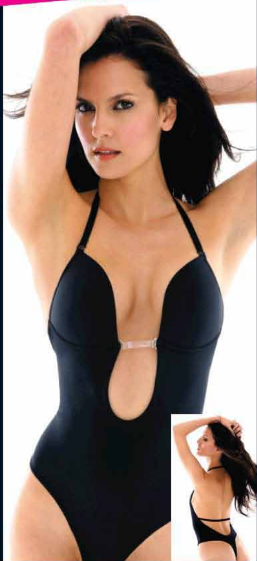
Ultimate Plunge Teddy $49.99